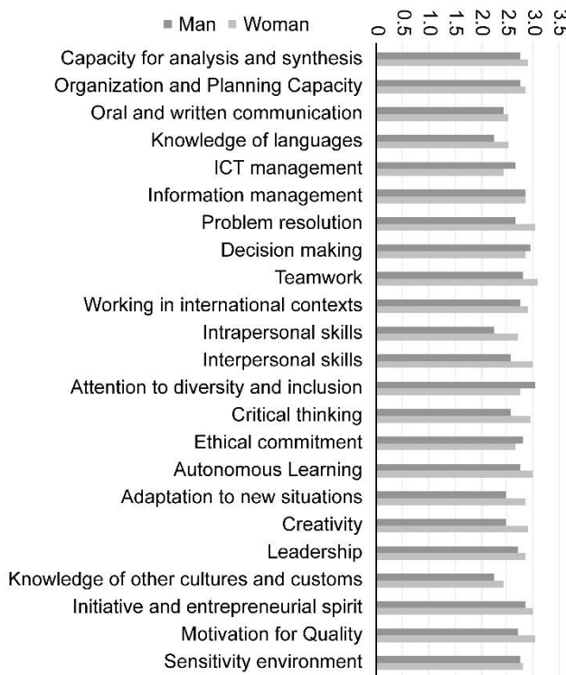
Figure 1.Level of transversal competences according to sex.

As shown in Figure 1, women reach higher levels in all transversal competences except for four of them, in which men reach higher scores: 1) information management (instrumental), 2) decision making (instrumental), 3) attention to diversity and inclusion (personal) and 4) ethical commitment (systemic).