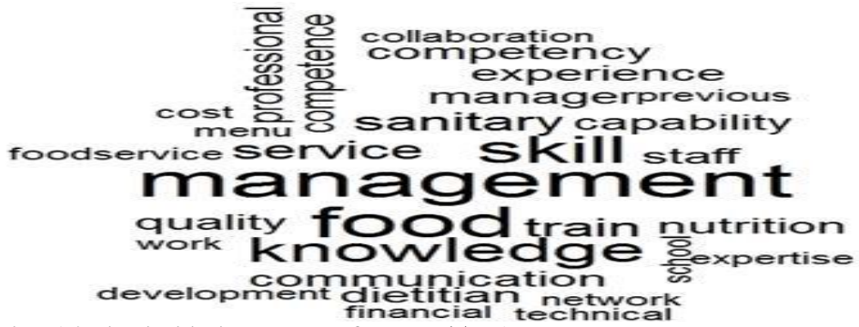
Fig 2. Word cloud