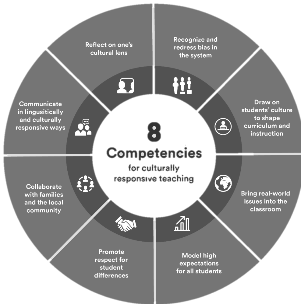
Figure 4: 8 Competencies for Culturally Responsive Teaching

A major part of teaching is student learning outcomes assessment. Traditional assessments are often plagued by biases that intentionally or unintentionally impact students based on personal characteristics such as race, gender, sexual orientation, socio-economic status, religion, culture, or place of origin. These biased assessments diminish the overall quality of educational delivery, serve as obstacles to student success, lead to incorrect inferences about student abilities, and contribute to the systematic oppression of students from historically marginalized groups.